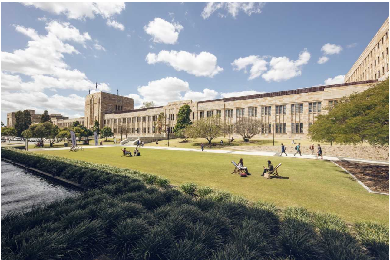
Figure E.1: The University Of Queensland

The Figure E.1 represents beauty of the UQ campus.