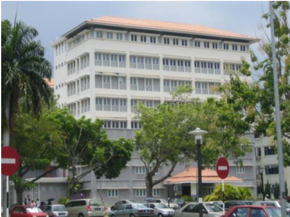
Plate 4.1: School of Computer Sciences, USM