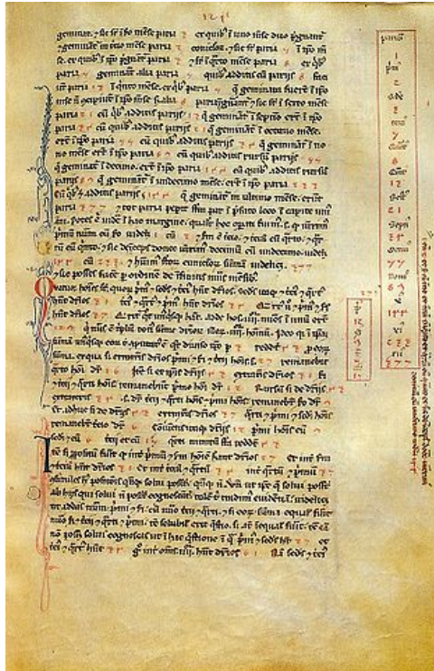
Figure 3.1: A page of Fibonacci’s Liber Abaci a very long title e just to prove my point more and more and more