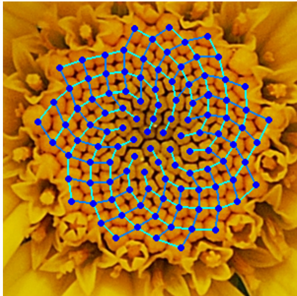
Figure 3.2: Yellow Chamomile head