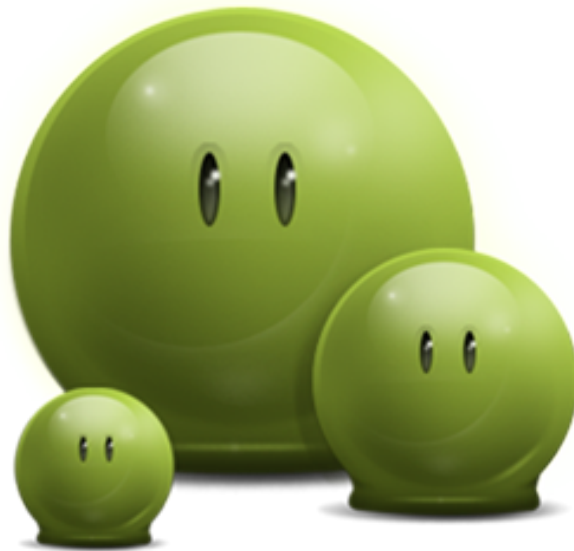
Figure 2.1: Example figure