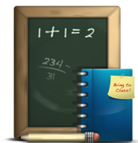
(b) This is another subfigure