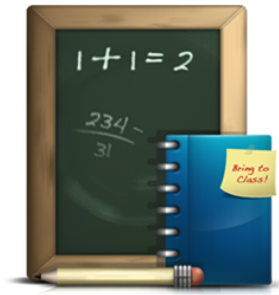
(b) This is another subfigure