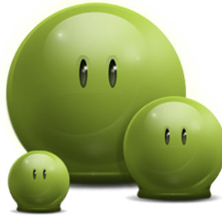
Figure 2.1: First figure. OK?

You can use the usual \text{\LaTeX} commands and environments: footnotes 1 too 2 , certainly with figures and tables as well.