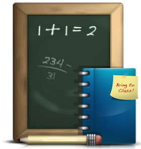
(a) This is a subfigure