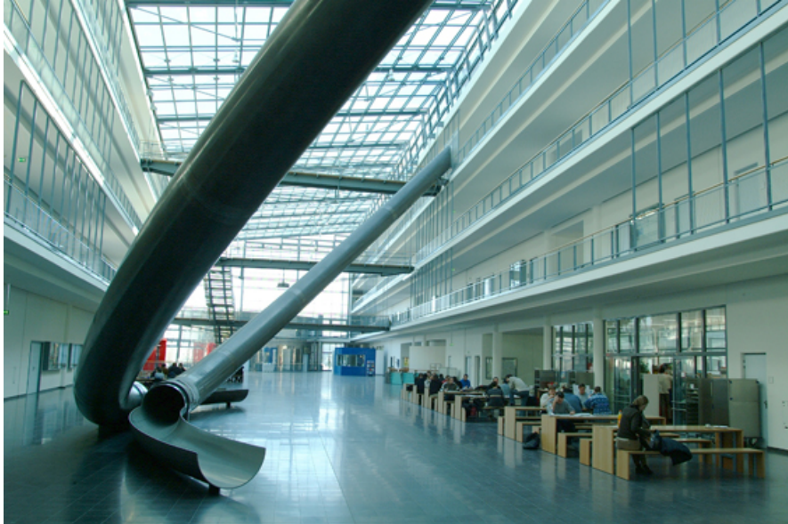
Figure 1.5: For pictures with the same name, the direct folder needs to be chosen.