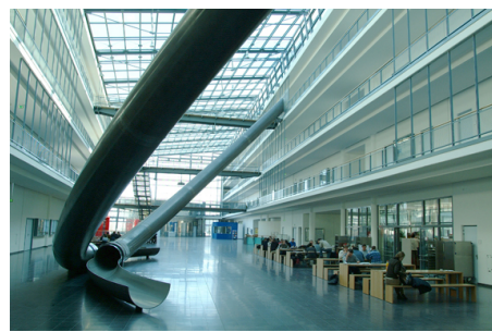
(b) The famous slide.