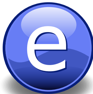
Figure 2.1: An electron (artist's impression).

Sometimes figures don't always appear where you specify in the source. The placement depends on how much space there is on the page for the figure. Sometimes there is not enough room to fit a figure directly where it should go (in relation to the text) and so \text{\LaTeX} puts it at the top of the next page. In this case, the argument (" [b] ") of the \begin{figure}[b] command indicates that the Figure 2.1 should be on the bottom (for example, " t " would be used to place the figure on top). Figures consistently placed on top or bottom of the page usually make life easier for the reader. Note that positioning figures is the job of \text{\LaTeX} and so you should focus on making them look good!