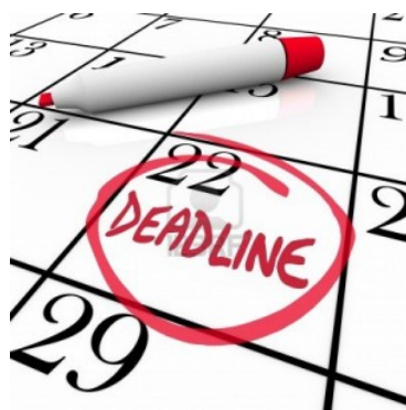
Figure 3.1 Example of single figure - All figures position is center and top by default - to change the figure position please use position command after beginfigure - Click Here to see further

The “how to” component of the proposal is called the Research Methods, or Methodology, component. It should be detailed enough to let the reader decide whether the methods you intend to use are adequate for the research at hand. It should go beyond the mere listing of research tasks, by asserting why you assume that the methods or methodologies you have chosen represent the best available approaches for your project. This means that you should include a discussion of possible alternatives and credible explanations of why your approach is the most valid. Fig 3.1 shows the example of single figure, fig 3.2 shows the example of 3-figures Subfloating and fig 3.3 shows the example of 2-figures Subfloating.