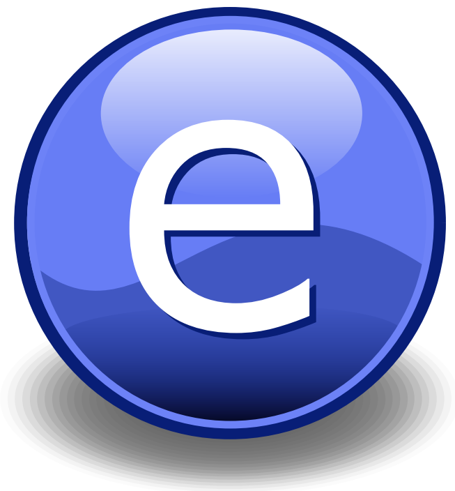
FIGURE 1.1: An electron (artist's impression).

Also look in the source file. Putting this code into the source file produces the picture of the electron that you can see in the figure below.