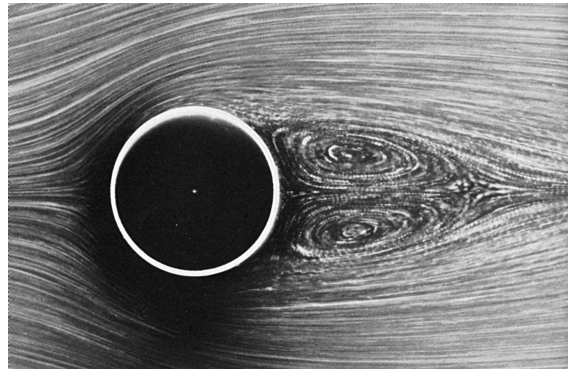
Figure 1: Caption written below figure.