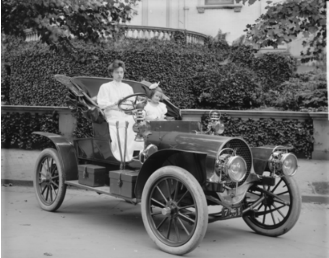
Figure 1: 1907 Franklin Model D roadster. Photograph by Harris & Ewing, Inc. [Public domain], via Wikimedia Commons. ( https://goo.gl/VLCRBB ).