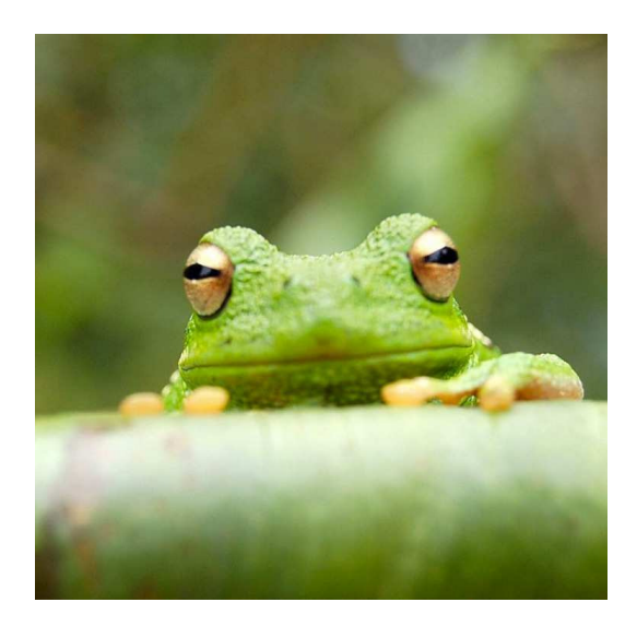
Fig. 1. Placeholder image of a frog with a long example caption to show justification settina.