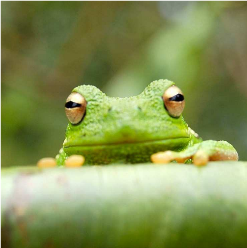
Fig. 2. This legend would be placed at the side of the figure, rather than below it.