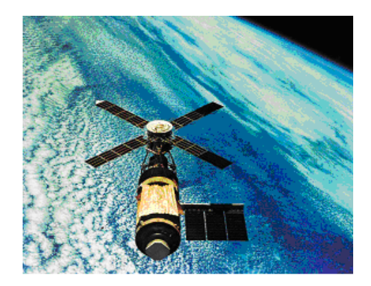
Fig 3 This satellite is a still image from Video 1 (Video 1, MPEG, 2.5 MB).

(.qt or .mov), MPEG (.mpg or .mp4). The recommended maximum size for each multimedia file is 10-12 MB. Authors must insert a representative still image from the video file in the manuscript as a figure. The caption label will be linked by the publisher to the actual video file. The video may also be mentioned in an existing figure caption. Multimedia files are treated in the same manner as figures and they will be numbered sequentially with normal figures. The video number, file type, and file size should be included in parentheses at the end of the figure caption. See Figure 3 for an example.