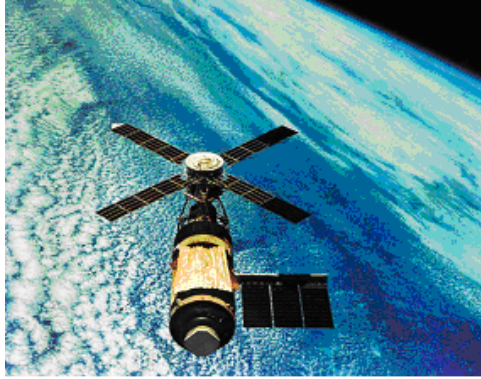
Fig 3 This satellite is a still image from Video 1 (Video 1, MPEG, 2.5 MB).

QuickTime Non-Streaming video (.qt or .mov), MPEG (.mpg or .mp4). The recommended maximum size for each multimedia file is 10-12 MB. Authors must insert a representative still image from the video file in the manuscript as a figure. The caption label will be linked by the publisher to the actual video file. The video may also be mentioned in an existing figure caption. Multimedia files are treated in the same manner as figures and they will be numbered sequentially with normal figures. The video number, file type, and file size should be included in parentheses at the end of the figure caption. See Figure 3 for an example.