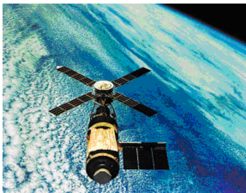
Video 3 Example of a multimedia still image (MPEG, 2.5 MB).

QuickTime Non-Streaming video (.qt or .mov), MPEG (.mpg or .mp4). The recommended maximum size for each multimedia file is 10-12 MB. Authors must insert a representative still image from the video file in the manuscript as a figure. This still image will be linked by the publisher to the actual video file, as will the caption label. The video may also be mentioned in an existing figure caption. Multimedia files are treated in the same manner as figures and they will be numbered sequentially with normal figures. The multimedia file type should be included in parentheses at the end of the figure caption, along with the file size. See Video 3 for an example.