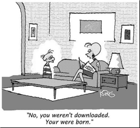
Figura 1. A typical figure

Figure and table captions should be centered if less than one line (Figure 1), otherwise justified and indented by 0.8cm on both margins, as shown in Figure 2. The caption font must be Helvetica, 10 point, boldface, with 6 points of space before and after each caption.