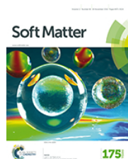
Fig. 2 An image from the Soft Matter cover gallery, set as a two-column figure.