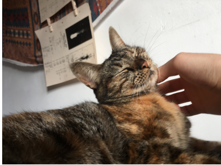
Figure 2: A cute dog.