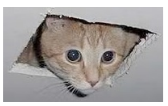
(b) Ceiling cat.