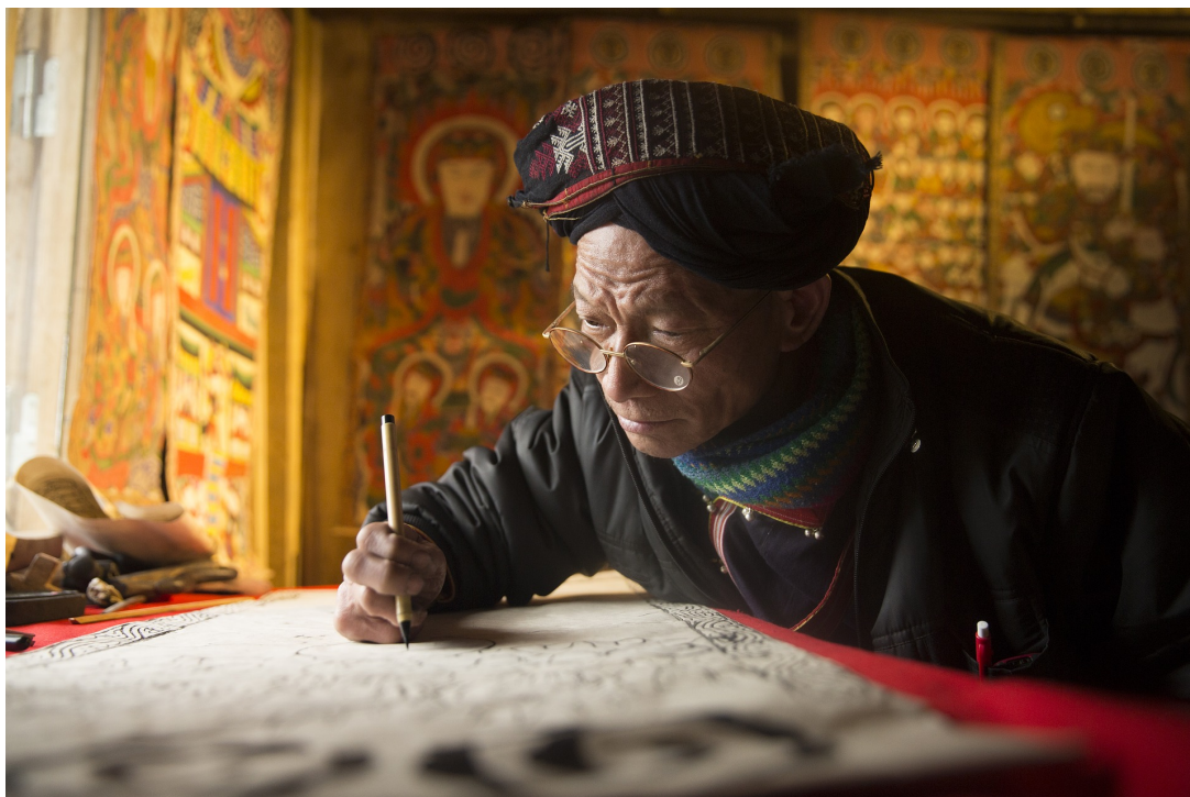
Figure 2.1: image1 of ch2

Now let's see how to add a table (see table 2.1).