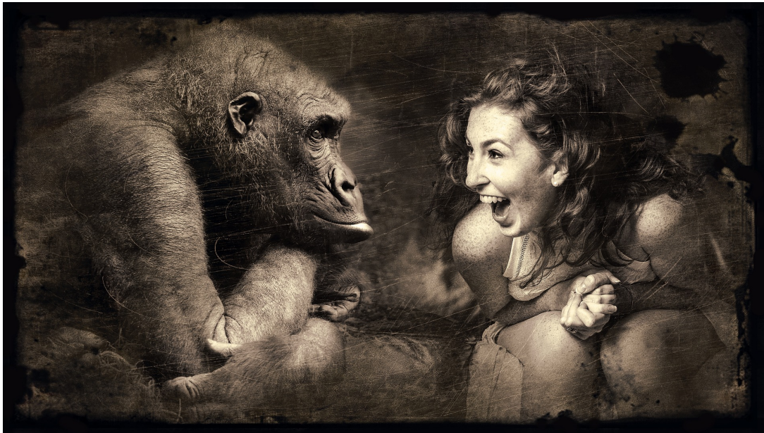
Figure 1.2: image3