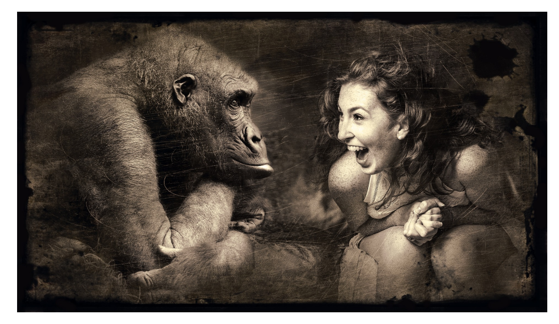
Figure 1.2: image3