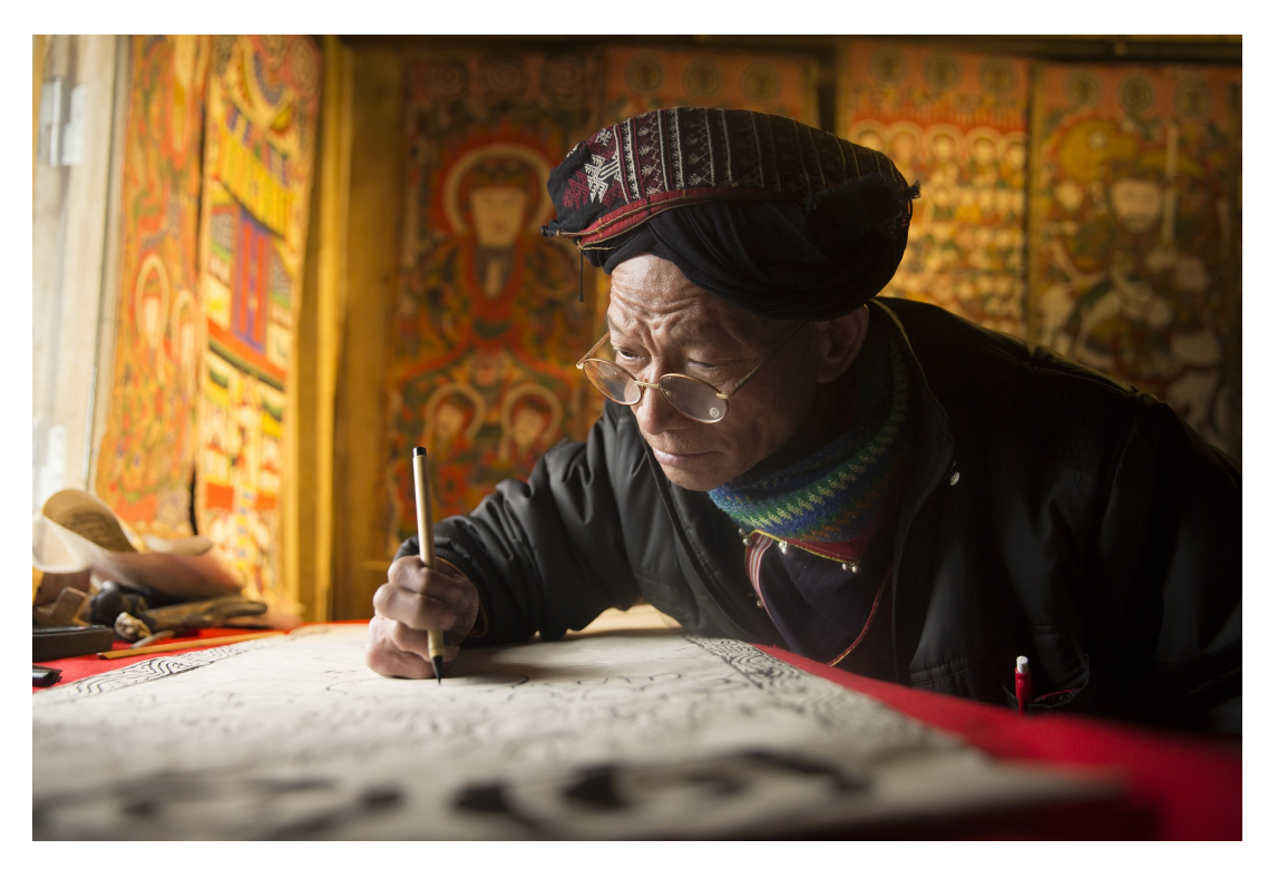
Figure 2.1: image1 of ch2