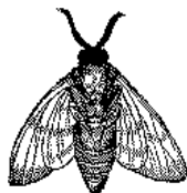
Figure 2: A sample black and white graphic (.eps format) that has been resized with the epsfig command.

Other common constructs that may occur in your article are the forms for logical constructs like theorems, axioms, corollaries and proofs. There are two forms, one produced by the command \newtheorem and the other by the command \newdef ; perhaps the clearest and easiest way to distinguish