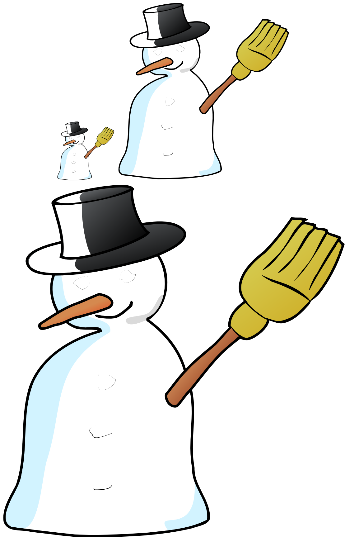
Figura 3.3: Imagem em formato PDF vectorial