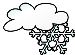
b Tempestade com neve