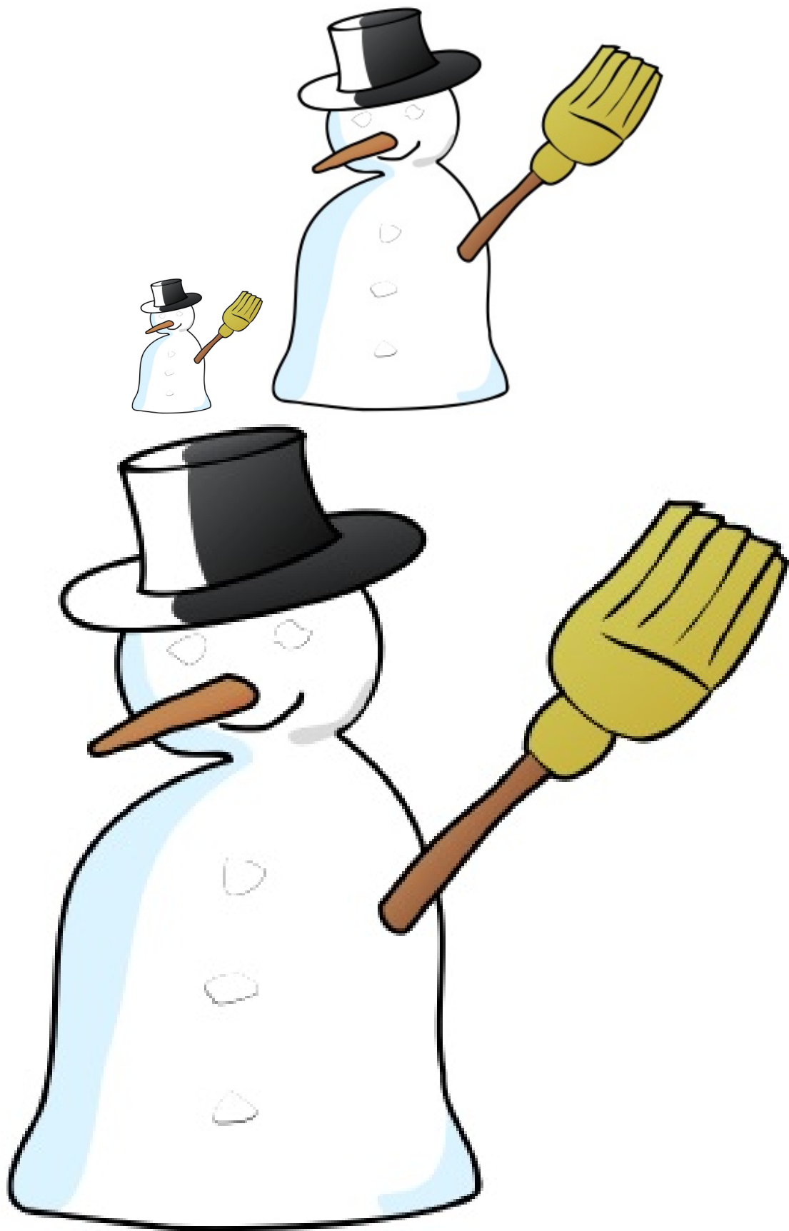
Figura 3.2: Imagem em formato bitmap (JPG)