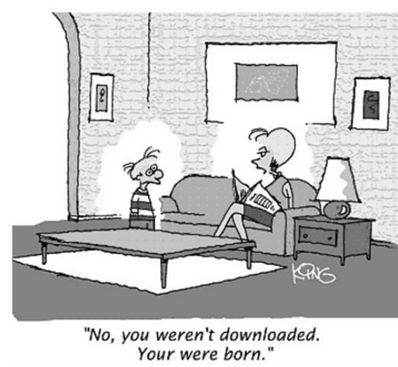
Figura 1. A typical figure

Figure and table captions should be centered if less than one line (Figure 1), otherwise justified and indented by 0.8cm on both margins, as shown in Figure 2. The caption font must be Helvetica, 10 point, boldface, with 6 points of space before and after each caption.