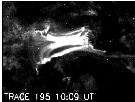
Figure 1. Example of a simple figure with only one panel. Relative units (here \textwidth ) are preferred so that the figure adapts automatically to the text width (this command is very useful in more complex figures such as Figures 2 and 3). The use of the command \includegraphics requires the inclusion of \usepackage{graphicx} at the beginning of the \LaTeX file.