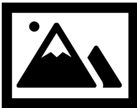
Figure 1: This is an example figure.

Figures should be called out within the text and numbered in the order of their citation in the text. Every figure must have a descriptive title beginning with “Figure [Number] ...” All figure titles should be either a phrase or a sentence; do not mix the two styles. See Figure 1 for example.