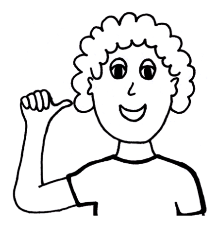
Figure 1. Here I am.

Placing figures is also very easy, as for example the following Figure 1: