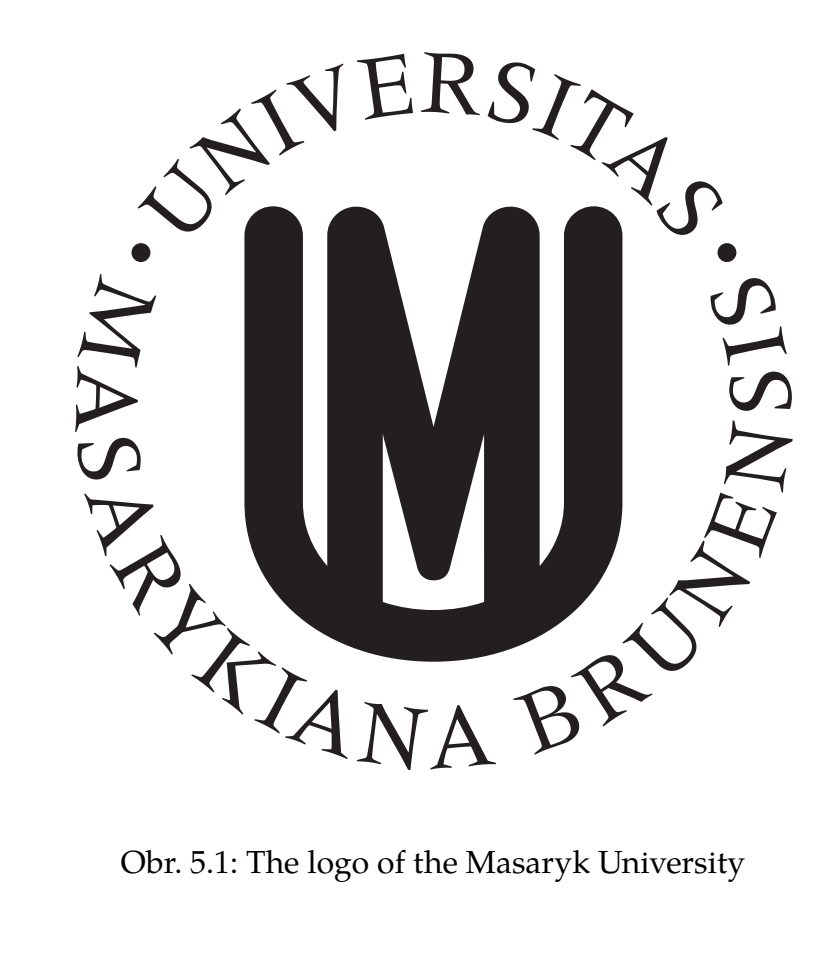
Obr. 5.1: The logo of the Masaryk University