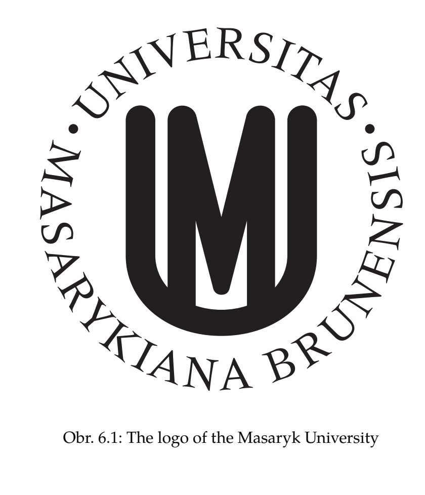
Obr. 6.1: The logo of the Masaryk University