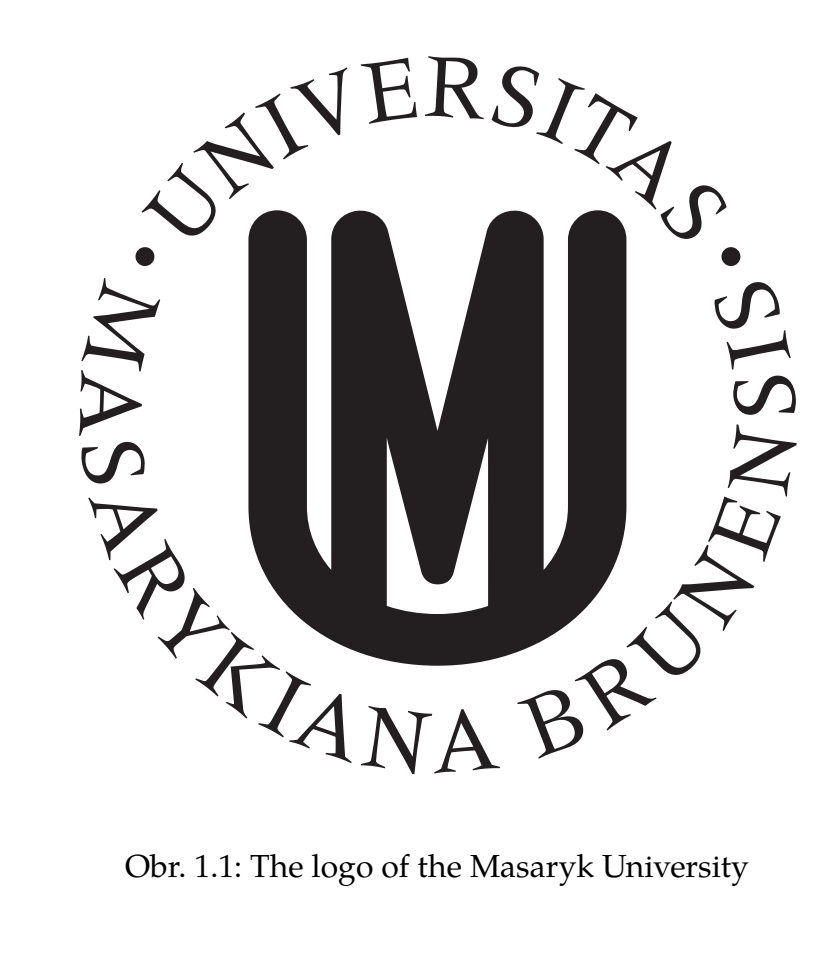
Obr. 1.1: The logo of the Masaryk University