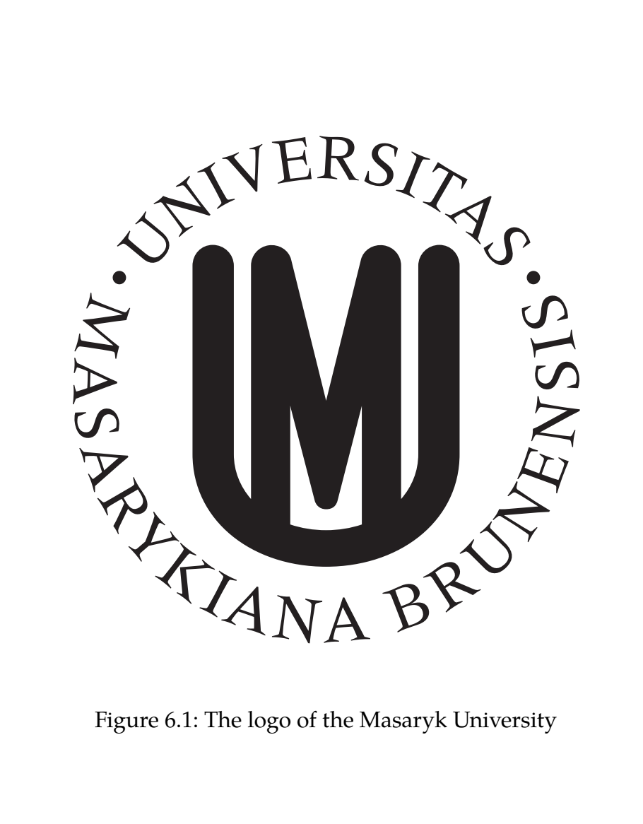
Figure 6.1: The logo of the Masaryk University