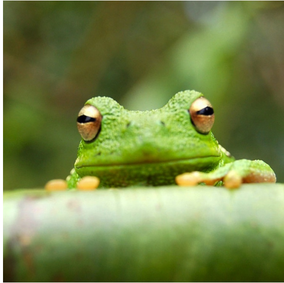
Illustration E.1: frog

\begin{Illustration}[!h] \centering \includegraphics[width=0.5\textwidth]{figures/frog.jpg} \caption{frog} \label{frog_image} \end{Illustration}