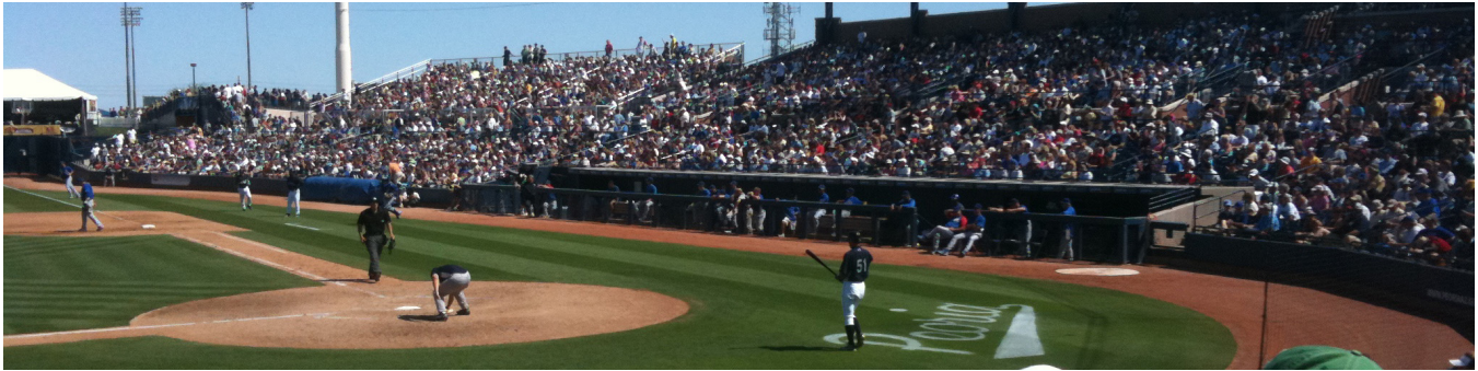
Figure 1. This is a teaser