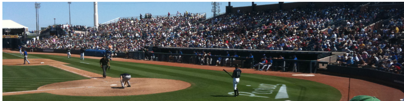
Figure 1. This is a teaser