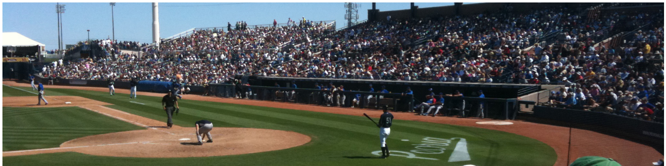
Figure 1: This is a teaser

Julius P. Kumquat The Kumquat Consortium jpkumquat@consortium.net