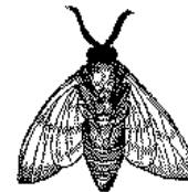
Figure 3: A sample black and white graphic that has been resized with the includegraphics command.

It is strongly recommended to use the package booktabs [15] and follow its main principles of typography with respect to tables: