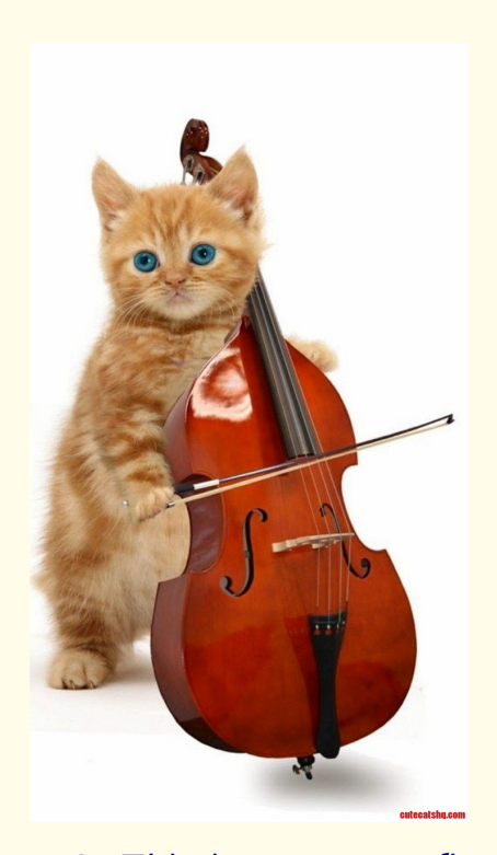
Figure 1: This is a sample figure!