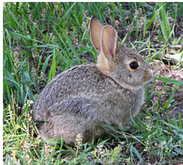
Figure 1: A rabbit

Floats are able to ‘float’ around a LaTeX document to ensure that spacing is well used. Importantly , this will never change the ordering of floats within a class.