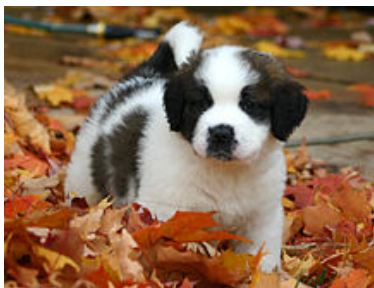
Figure 3: A mouse with the ‘t’ option allowing it to be at the top of the page

Importantly these constraints can be combined. For example the puppy of Figure 3 is placed using the !htbp option.