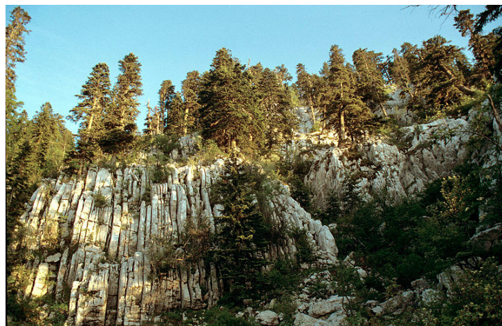
Dinaric calcareous Karst block fir forest in Orjen.

The section on habitat suitability for tree species focuses on the European silver fir and can be used as an example of how the PESETA project works. The habitat suitability study incorporates data on existing tree distribution, bioclimatic factors, topography, and solar irradiation using a method known as the Relative Distance Similarity-Maximum Habitat Suitability Method (RDS-MHS).